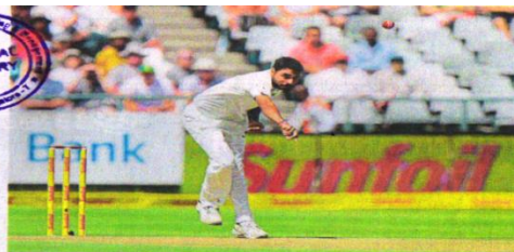
Bowlers call the shots on Day 1